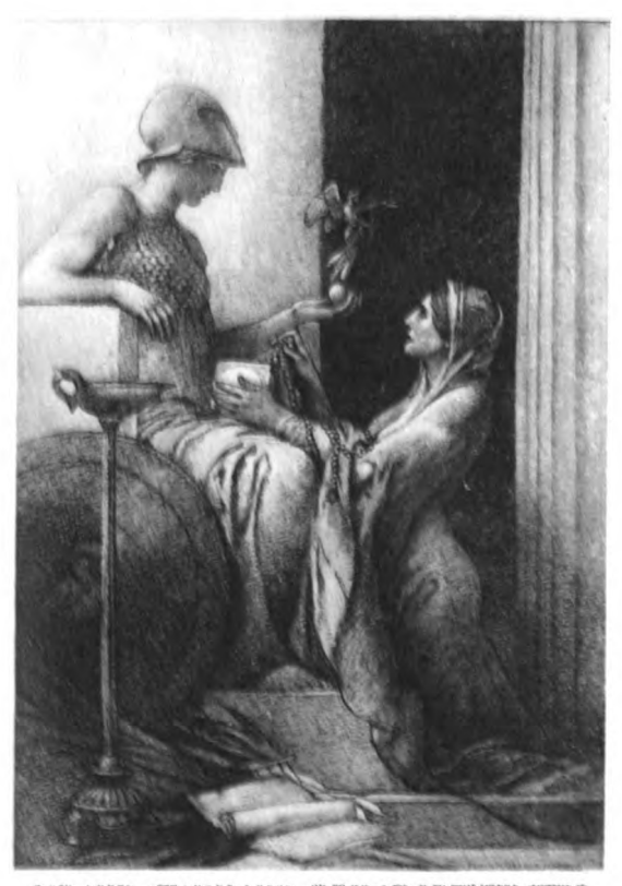
LELAND STANFORD JVNIOR VNIVERSITY